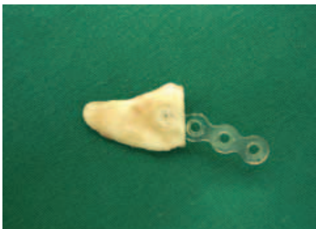
Fig. 4 The coronoid process and the resorbable plate 2.0 system BIONX

On the same day the patient was discharged from the recovery room and brought to the ward.