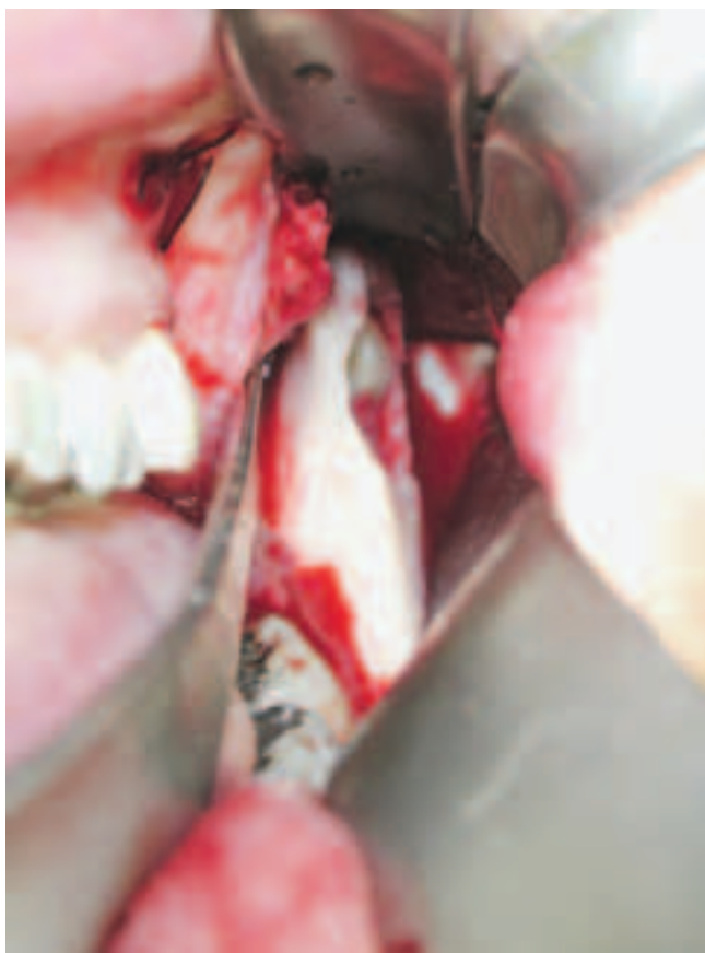
Fig. 3 The surgical approach and exposing the tooth from the buccal aspect of the ascending ramus after removing the coronoid process