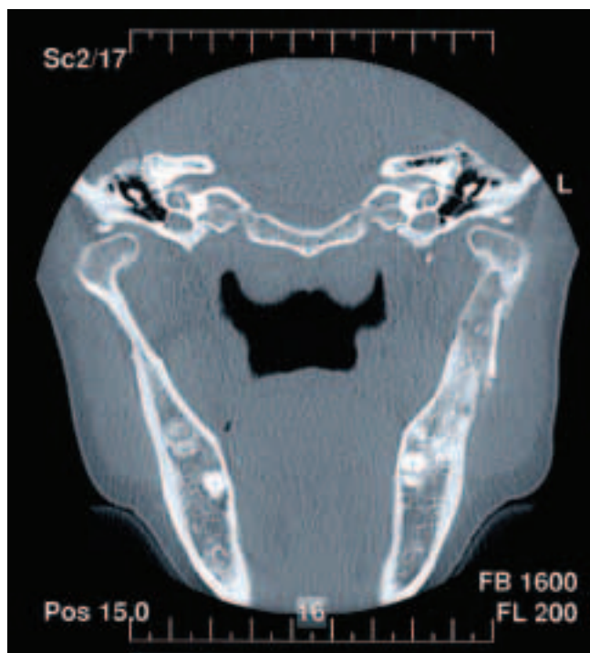
Fig. 5 Controlling CT-scan section after 6 months post operatively showing the coronoid cover