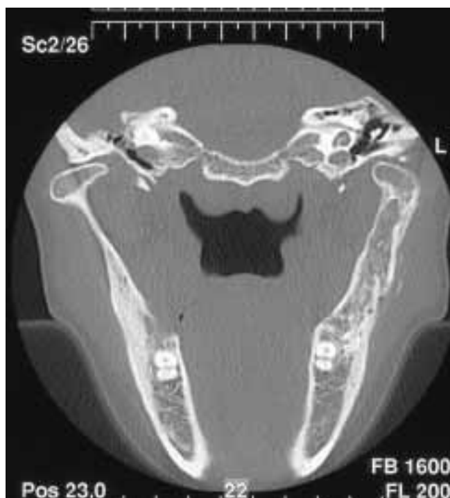
Fig. 6 One year controlling CT-scan section