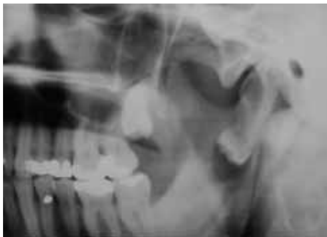
Fig. 1 Panoramic x-ray showing the high dislocation of the left lower third molar into the condylar region

After an endonasal tube was introduced successfully on the right side, monitors were applied. The patient was prepped and draped in a typical sterile fashion.