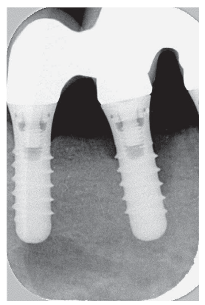
Fig. 2 Case 2: Exemplary X-ray of a localized peri-implantitis. The residual dentition and the implants are without any pathological findings, i. e. no caries and periodontal involvement. Probing depths are only increased and localized around the implant (>6 mm) and there is bleeding and suppuration. The implant is stable. The patient is systemically healthy, non-smoker and compliant with good oral hygiene.

the specialists reported to do so (p>0.05). More than 75% of the dentists also reported to place implants in smokers (up to 20 cigarettes).